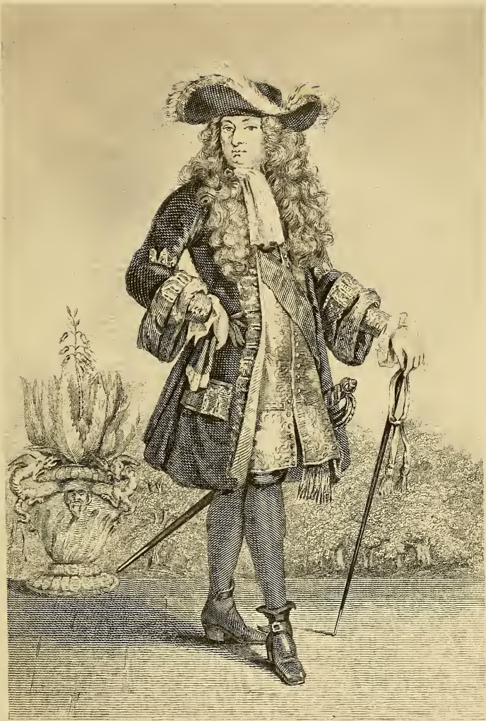
Louis XIV at Marly.